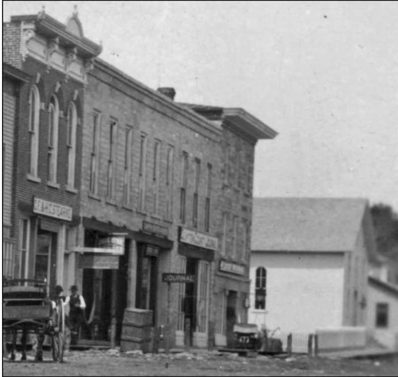
Photographs: Historic views, west side of North Main Street, looking northwest with Carter and Co. Building on the corner and with the old Turner Hall in background , pre-1891 – top; 100 block of N. Main, looking south, 1942 – bottom